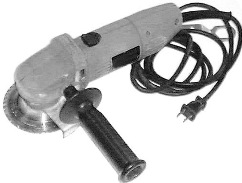
4-1/2" angle grinder w/ diamond masonry blade

If the bell-shaped tile hub where you insert the clean out has broken away, you have a couple of options. The first is to dig down to the next hub joint, remove the broken piece, and purchase a replacement tile pipe at a building supply company. You can connect the new pipe to the next one with a rubber gasket (purchase it where you buy the replacement piece), or you can mortar it in place. Should the new piece of clay tile pipe be too long, cut it outside with a concrete saw or an angle grinder with a masonry cutter blade. Then you can mortar the PVC wye into the hub.