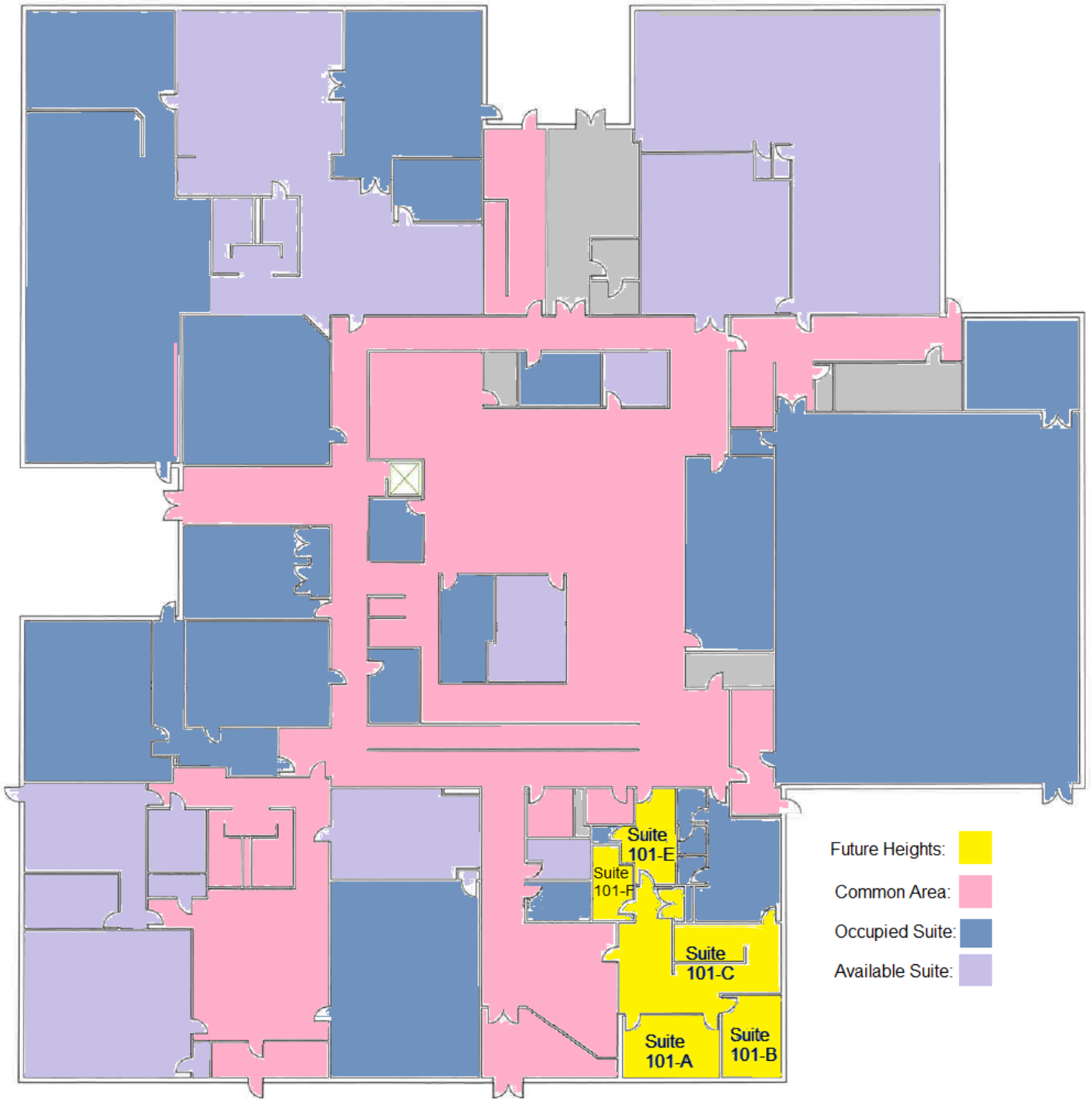
EXHIBIT A DESCRIPTION OF THE PREMISES