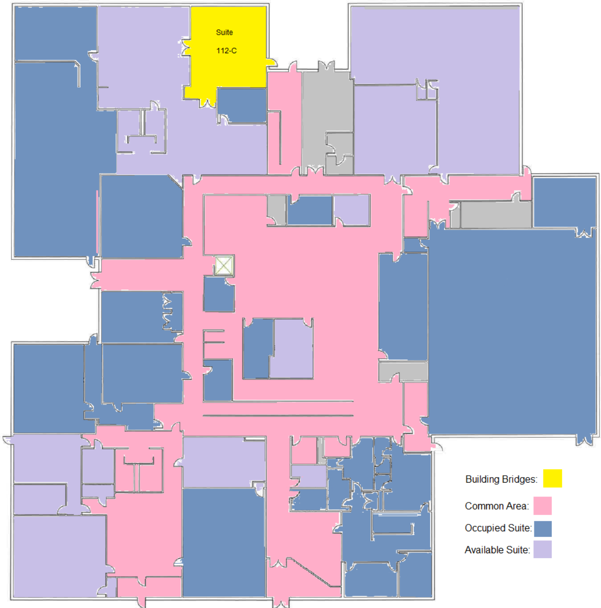
EXHIBIT A DESCRIPTION OF THE PREMISES