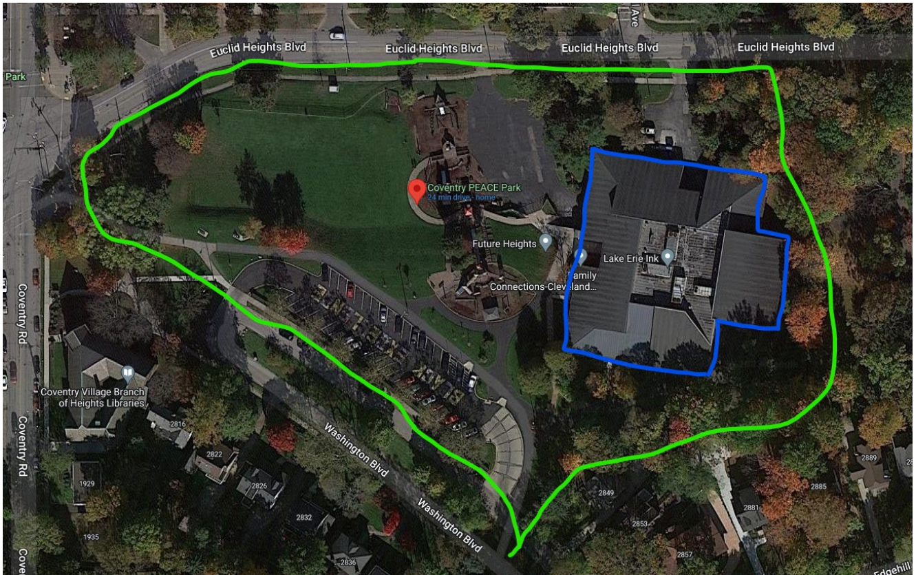
Coventry PEACE Building outlined in Blue Property outlined in Green