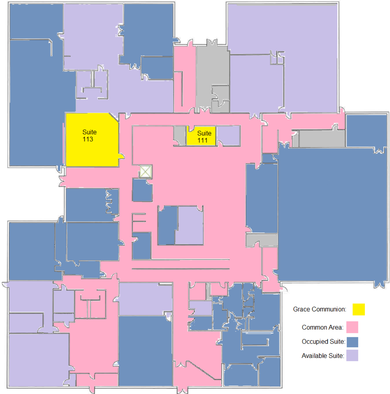
EXHIBIT A DESCRIPTION OF THE PREMISES