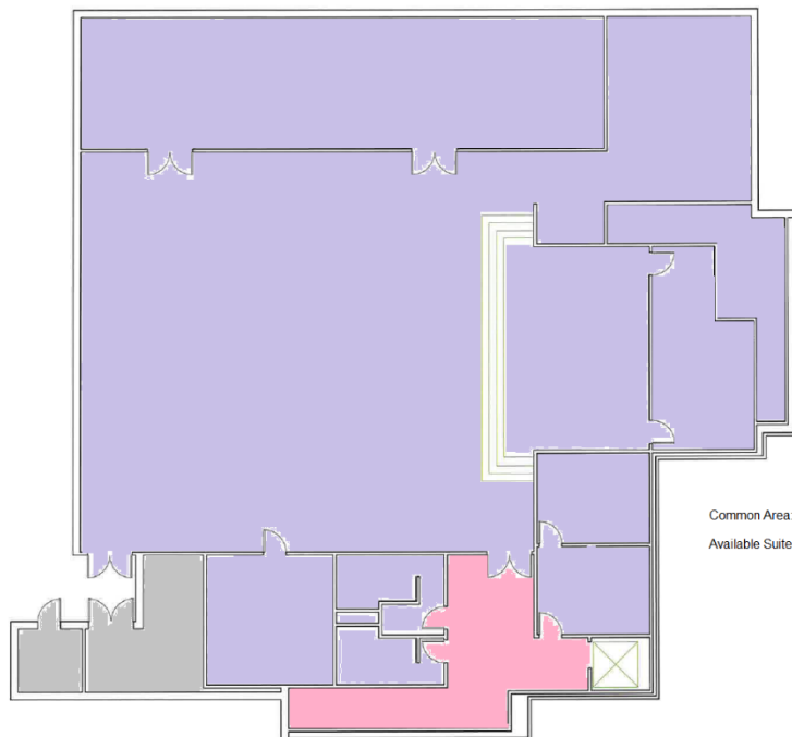
COVENTRY PEACE BUILDING BASEMENT FLOOR PLAN